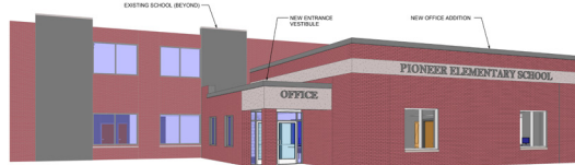
Pioneer Office Addition